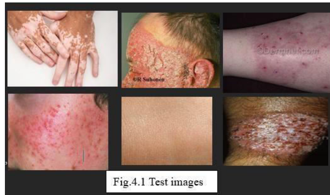
Fig.4.1 Test images

Figure 4.1 shows sample test images from different skin disease categories used to evaluate the trained model. These images represent real-world variations in skin texture, color, lighting conditions, and lesion patterns. The test samples include conditions such as acne, eczema, psoriasis, vitiligo, tinea, and normal skin. The purpose of presenting these test images is to demonstrate the diversity of the dataset and to validate that the trained MobileNet model can generalize well to unseen images. Despite variations in background and skin tone, the model successfully extracted discriminative features and produced accurate.